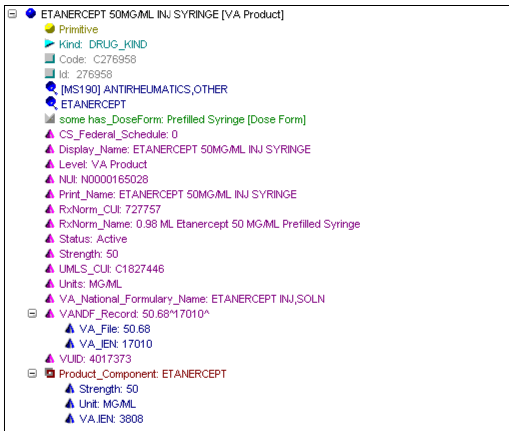
Figure 3: Orderable Drug Content Modeling with Incremental Role Relationship (green)

Only one additional role ( has_DoseForm ) has been modeled at this orderable drug level of the drug hierarchy. Generic ingredient level modeling (Figure 2) will be inherited down the drug hierarchy to all descendant concepts (such as this one) automatically by inference.