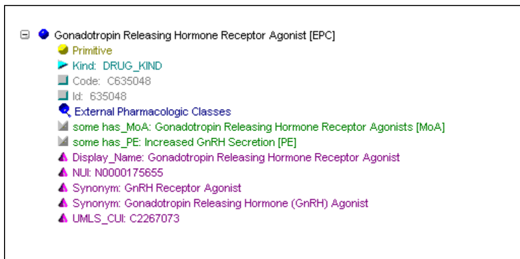
Figure 4: External Pharmacologic Class Content Modeling with Role Relationships (green)

Figure 4 illustrates content modeling in an External Pharmacologic Class concept in order to capture FDA SPL indexing of an FDA Established Pharmacologic Class.