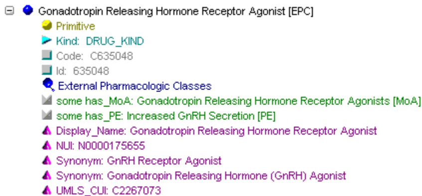
Figure 4 – External Pharmacologic Class Content Modeling with Role Relationships (green)

Figure 4 illustrates content modeling in an External Pharmacologic Class concept in order to capture FDA SPL indexing of an FDA Established Pharmacologic Class.